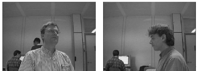
Figure 2. Example images take during data collection as used for training and testing of the neural nets

During data collection, the person that we collected data from had to sit on a chair on a specific location in the room, with his eyes at a height of approximately 130cm. In a distance of one meter and at a height of one meter a video camera to record the images was placed on a tripod. We placed marks on three walls and the floor on which the user had to look one after another. The marks were placed in such a way that the user had to look in specific well known directions. The marks ranged from -90 degrees to +90 degrees for pan, with one mark each ten degrees, and from +15 degrees to -60 degrees for tilt, with one mark each 15 degrees. This means that during data collection the user had to look at 19 x 6 specific points, from top to bottom and left to right. Once the user was looking at a mark, he could press a mouse-button, and 5 images were being recorded to hard-disk, together with the labels indicating the current head pose. This resulted in a set of 570 images per user. In order to collect slightly different facial images for each pose, the user was asked to speak with the person assisting the data collection. Figure 2 shows two example images recorded during data collection. In this way, we collected data of 14 male and 2 female subjects. Approximately half of the persons were wearing glasses.