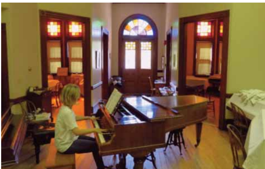
Experimenting on a historic grand piano in The Frederick Collection of Historic Pianos.