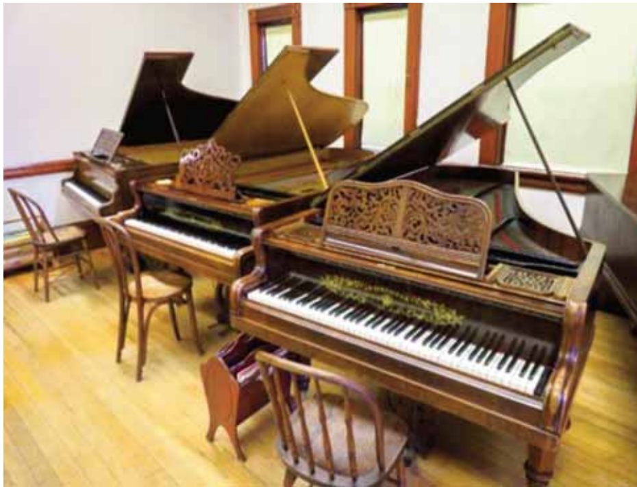
Three grand pianos from The Frederick Collection of Historic Pianos. From left to right: 1893 Erard, the same model as Ravel's piano; 1871 Streicher; 1868 Streicher, the same model as Brahms' piano