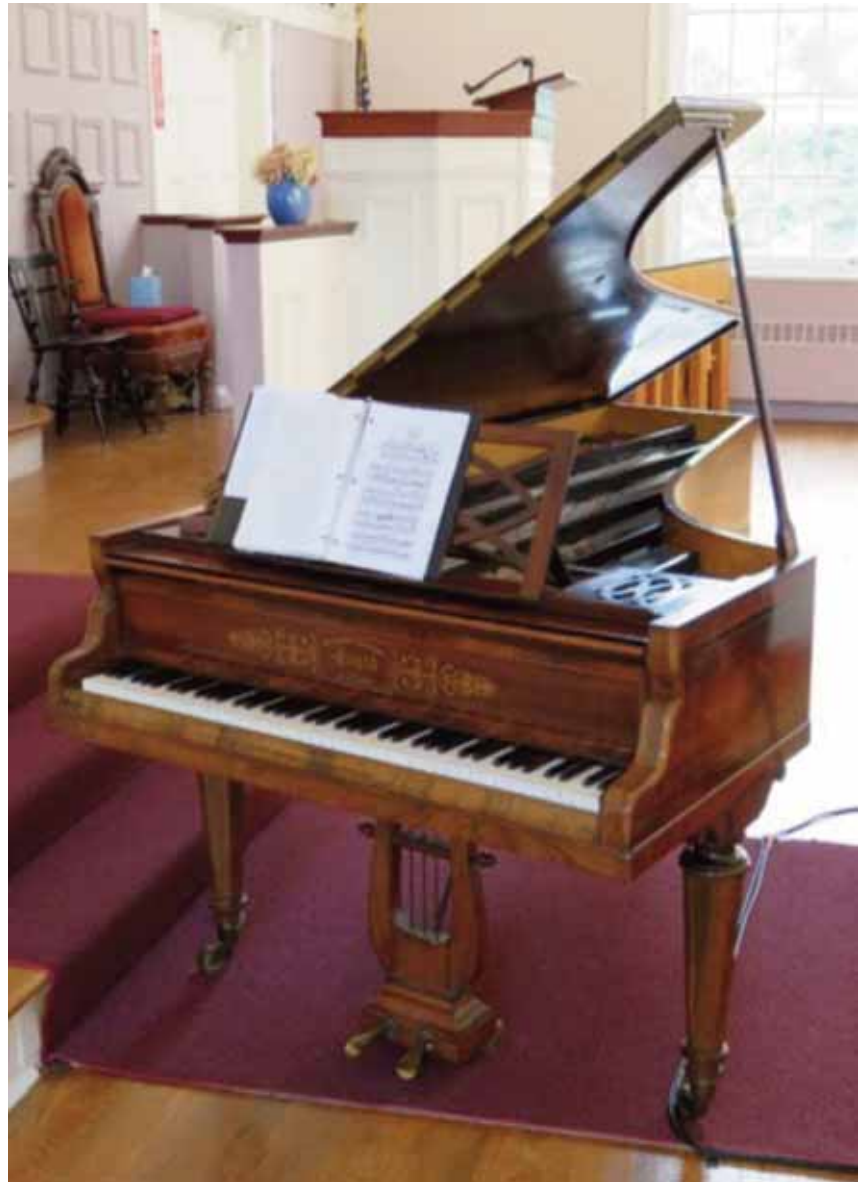
An Erard (Paris, 1840) from The Frederick Collection of Historic Pianos.

Pat: There are some people renovating older pianos to get them in playing condition, but in most cases all the pianos after they have been renovated sound the same because people have some pre-conceived idea of what they are supposed