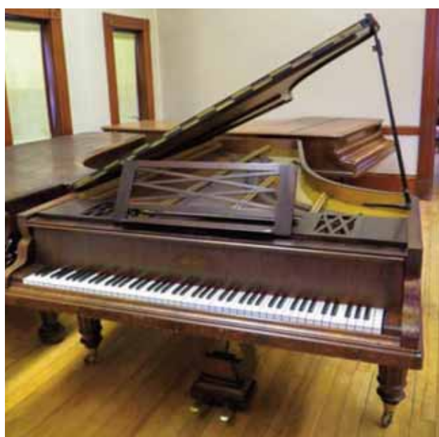
From The Frederick Collection of Historic Pianos, an Erard 1877 "Extra-grand modèle de concert" with 90 keys to low G and G#, used by Ravel.