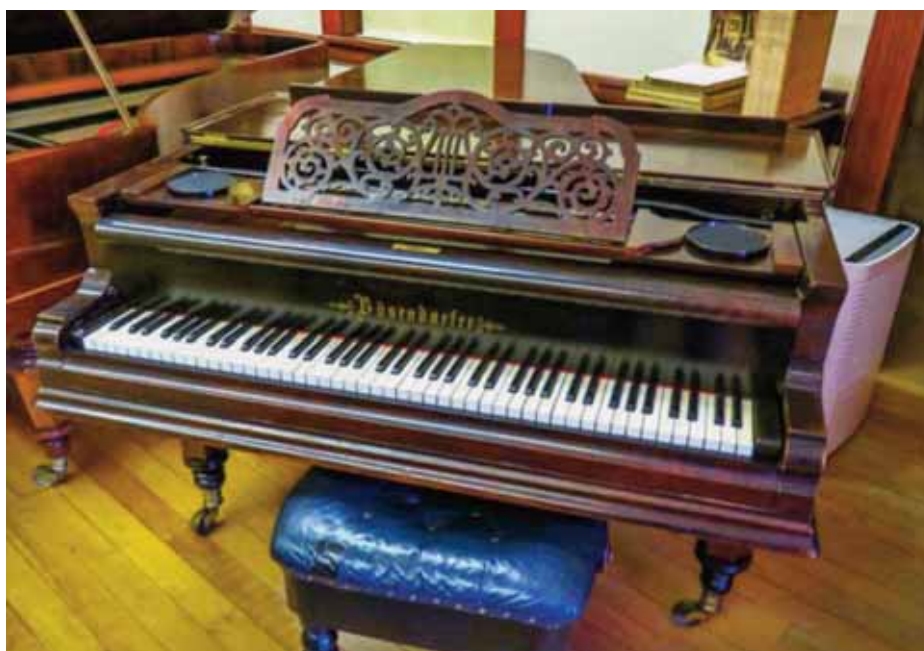
1877 Bösendorfer Grand from The Frederick Collection of Historic Pianos.

Pat: There is another thing about museum pianos, we kind of joke that there are four categories of pianos that museums often interested in that we are not. We have funny names for them. One is the eye candy piano, where they are amazing looking, maybe angels holding it up, a landscape inside the lid, or something like that. We don't do that. We have some very nice looking pianos which probably survived because they were beautiful. But we got them for their musical value and their relationship to the composer. We don't do what we call the holy relic , say somebody's fingernail. In this case it would be a piano that would have belonged to some very famous or very wealthy person, a great pianist. We don't do that. We have been offered pianos like that, don't you want this piano,