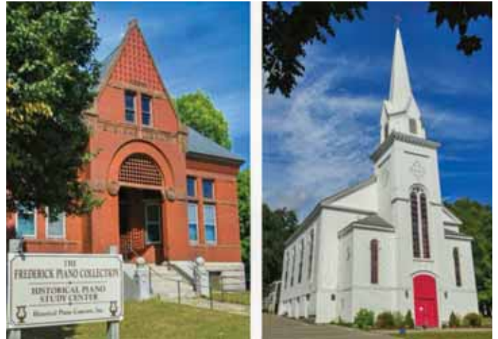
The Frederick Piano Collection in the old library building and the Ashburnham Community Church