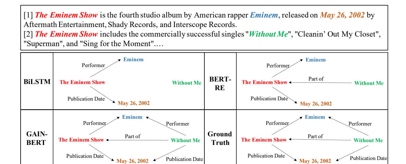
Figure 3: The case study of our proposed GAIN and baseline models. The models take the document as input and predict relations among different entities in different colors. We only show a part of entities within the documents and the according sentences due to the space limitation.

inevitable restriction in practice, where many realworld relation facts can only be extracted across sentences. Therefore, many researchers gradually shift their attention into document-level relation extraction.